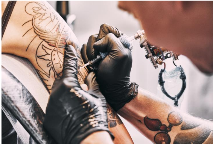
Image 1: In no other working environment is such (almost) irreversible work carried out than in a tattoo studio. That's why a tattoo studio needs a lighting system with minimum glare and bright, precise light, to ensure that tattooists' eyes don't tire too quickly, especially when working on detailed tattoos.