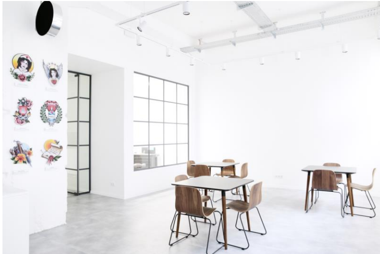
Image 3: When designing the rooms, edding focussed on creating a modern, bright atmosphere. In the lounge area and consultation corner, Zumtobel spotlights were installed on a track.